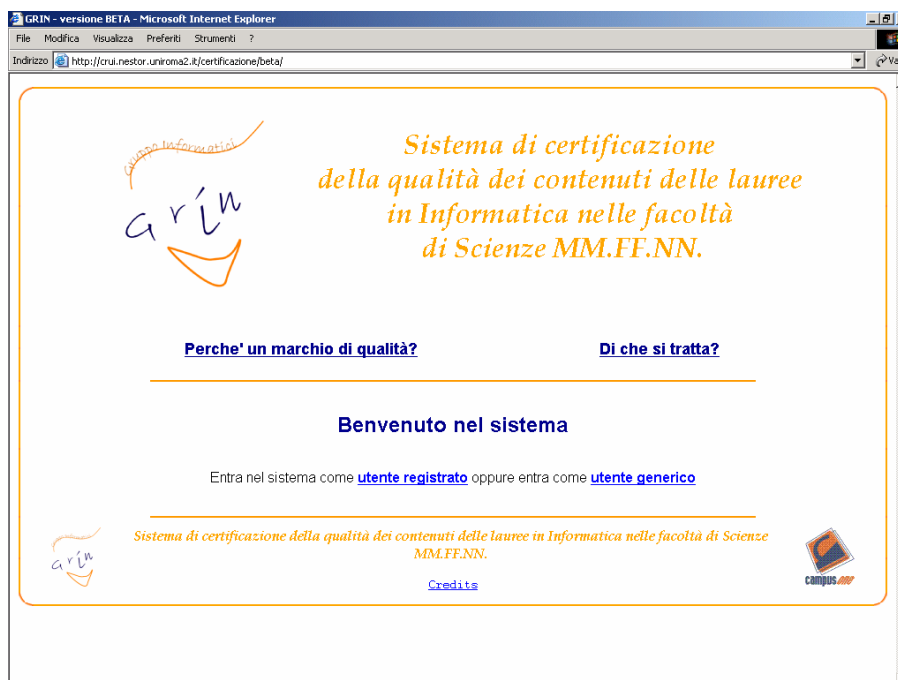
Fig.2: The certification site home page

As mentioned before, in order to manage the certification process, a web site is maintained by the NESTOR Laboratory at Università di Roma “Tor Vergata”. By selecting the link utente generico in the home page of the certification site (Fig.2), the list of the Italian Universities which obtained the GRIN quality certificate is shown. The other link ( utente registrato ) is reserved to the chair of each University degree program in Computer Science to insert and update data before the annual application deadline for certification.